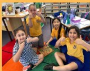
Year 1s enjoying some play in week 3