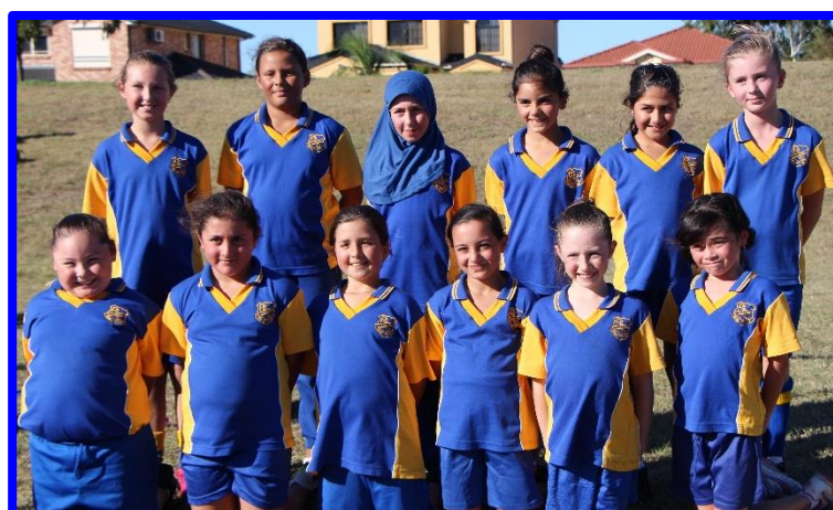
Junior Team - GVPSSA Premiers