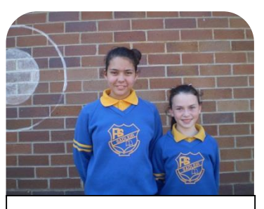
Yarn Up participants