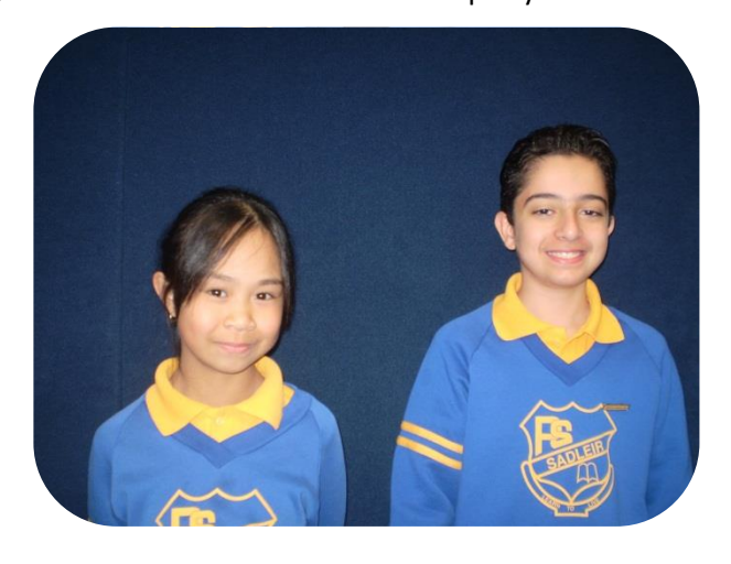
Stage 3 Spelling Bee winners

I was very happy and surprised that I won, especially when I got to get a present, which was new clothes and a little party with lots of ice cream.